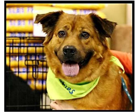
Tori, a female Golden Retriever/Shepherd mix came to us from a rural kennel where she lived for several years locked in a cage. She is a shy but loving girl looking for her forever home!

DONATIONS!! While we are not yet a registered 501(c)(3) charity, we still are able to collect donations - they just are not tax deductible until we receive our exempt status from the IRS. Once we do, all donations will be deductible. And even though we are not yet exempt, we will continue to shelter, vet and care for many needy dogs who cannot wait for our "official" status. So please open your heart and pocket book to one of our needy dogs TODAY!