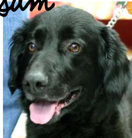
Male Lab/Spaniel Mix Rescued from Hoarder Adopted June 2007