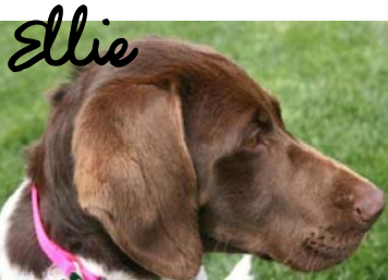
Female German Pointer Mix Rescued from Euthanization Adopted June 2007