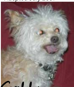
Female Yorkie-Poo Owner Ill - Could not Keep Adopted July 2007