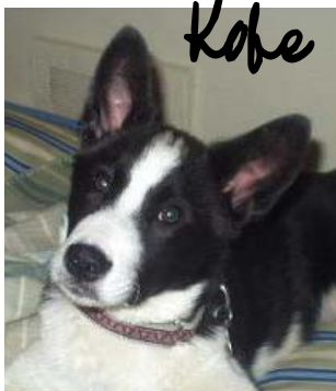
Male Husky/Border Collie Mix Rescued from Euthanization Adopted June 2007