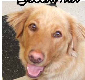
Female Sheltie/Shetland Mix Thrown from Moving Vehicle Adopted June 2007