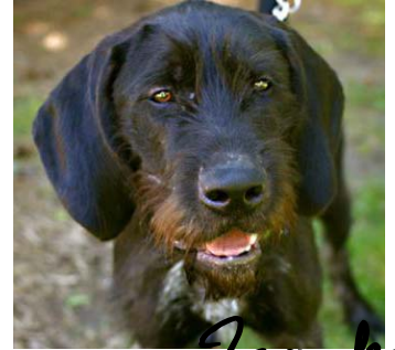
Male Wirehaired/Hound Mix Rescued from Euthanization Adopted June 2007