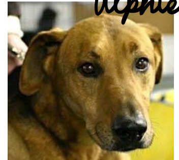
Male Wolfhound/Shepherd Mix Rescued from Hoarder Adopted June 2007