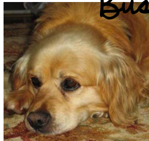
Male Cocker Spaniel Left Behind when Owners Moved Adopted June 2007