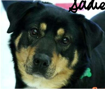
Female Rottie Mix Rescued from Hoarder Adopted July 2007