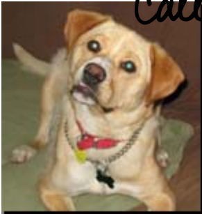
Female Retriever Mix Rescued from Euthanization Adopted July 2007