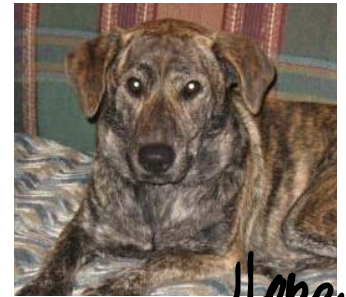
Female Hound Mix Rescued from Euthanization Adopted June 2007