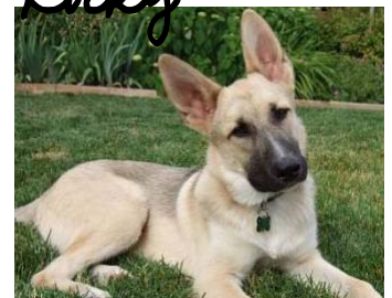
Male German Shepherd Rescued from Neglectful Home Adopted July 2007