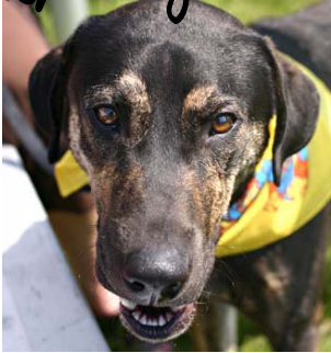
Male Shepherd/Hound Mix Rescued from Euthanization Adopted June 2007