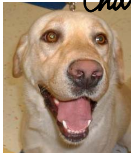
Male Yellow Lab Rescued from Euthanization Adopted June 2007