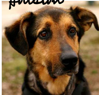
Male German Shepherd Mix Rescued from Euthanization Adopted June 2007