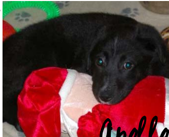
Male Lab/Collie Mix Rescued from Euthanization Adopted June 2007